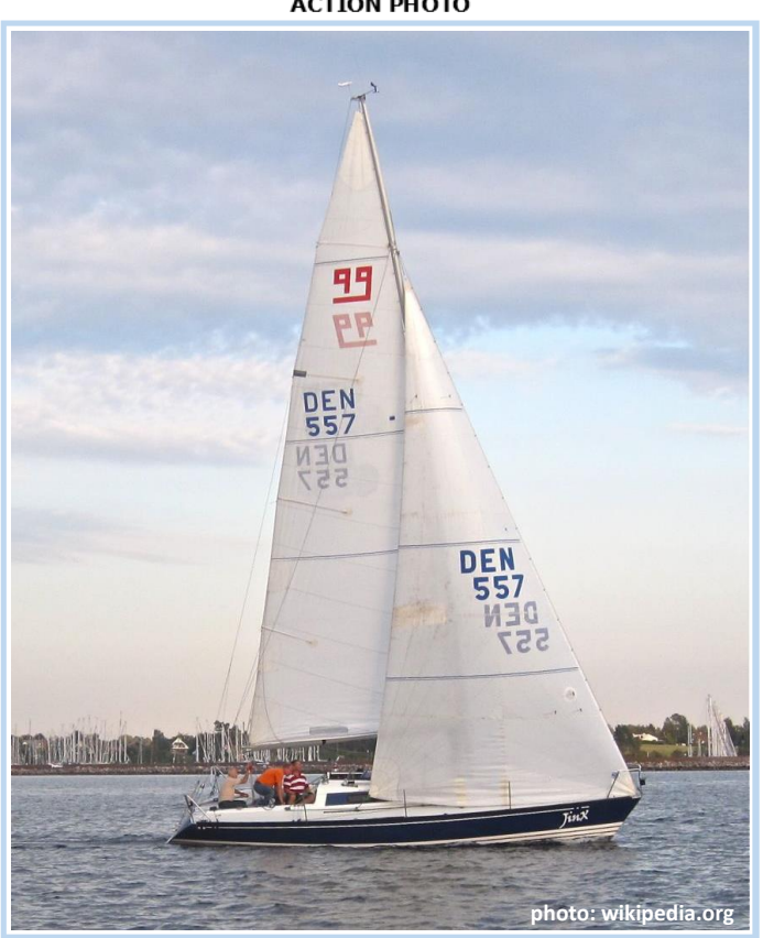
SOL RACE RECORD