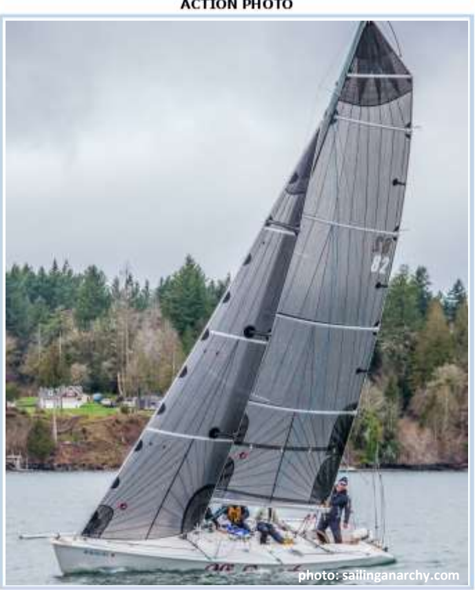
SOL RACE RECORD

Designed in 1990 by Ron Holland and Rolf Gyhlenius, the 11m One-Design is an early value-for-money strict one-design keelboat. The design has stood the test of time and today fleets continue to be raced at various centres in Scandinavia and elsewhere in Europe and Australia.