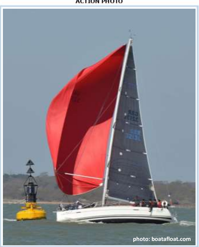
SOL RACE RECORD

Having exhausted all practical lengths ending in .7 for its First range during the Noughties, Beneteau switched to round numbers as the next decade began, and thus the First 40 was born, a straight-stemmed racer cruiser (rather than cruiser racer) that like its predecessor, the 40.7 had, and has, an impressively handicapped turn-of-speed, both in ORC and IRC. Many other straight-stemmed rounded number sisters have since followed.