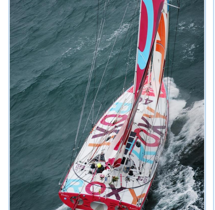
SOL RACE RECORD

Of overall length between 59ft and 60ft and draft less than 4.5m, the Open 60 Rule is not even a "Box". With almost everything else – bar the use of materials with a specific gravity greater than 11.3 (e.g. gold, spent uranium and the like) – "unrestricted", no two Open 60s are identical, and every year continuous innovation makes them faster.