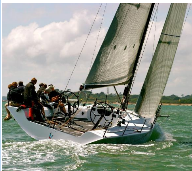
SOL RACE RECORD