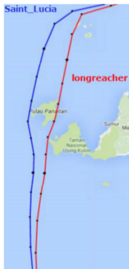
The dash for the podium

Two days later, the five of us were within shouting distance of one another, but then aner must have found a huge spinnaker somewhere, because she went past us like we were standing still. From there to the finish, the remaining four of us traded 2 nd place back and forth as we tried unsuccessfully to close the gap to aner. In the end, I made a quick gybe east of Palau Panaitan and was able to secure a spot on the podium.